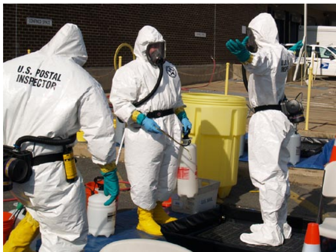
U.S. Postal Inspectors regularly conduct biohazard drills at postal facilities nationwide.

Note: Care must be given not to violate an individual employee's privacy. All information should be treated as extremely sensitive. This information should be shared with the mail center security coordinator in the event that a suspicious package is received. The information should not be disseminated to other employees.